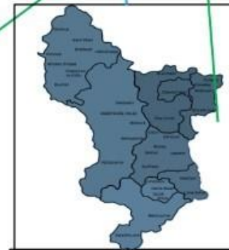
A map of the Derbyshire collieries (red circles) located around Chesterfield and our local area.